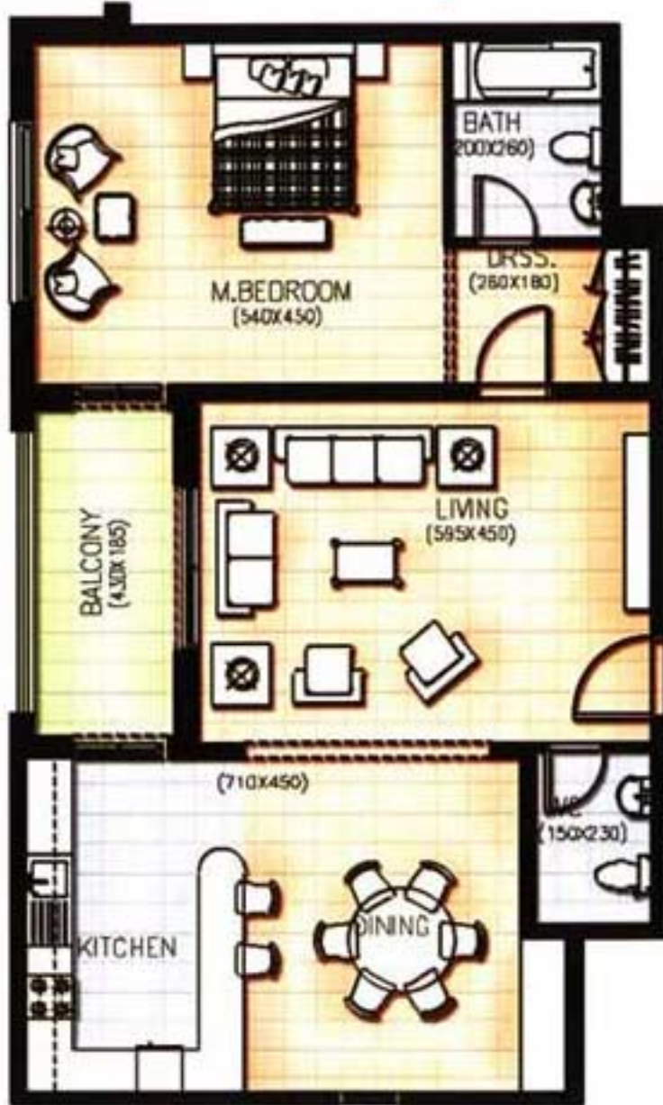
Typical 1 Bedroom with Balcony