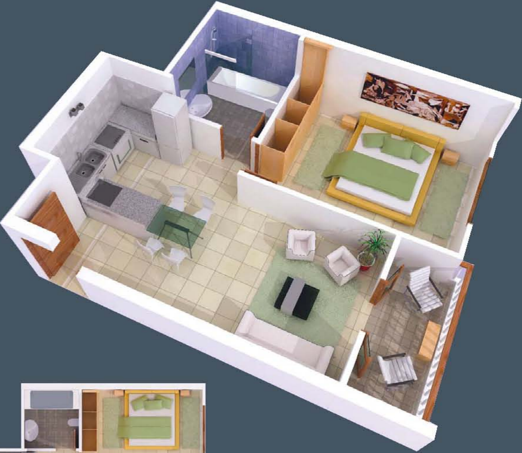
ONE BEDROOM APARTMENT

The internal space has been designed to disperse the beautiful natural sunlight. Open-plan kitchenettes provide owners with the maximum feeling of space within the apartment.