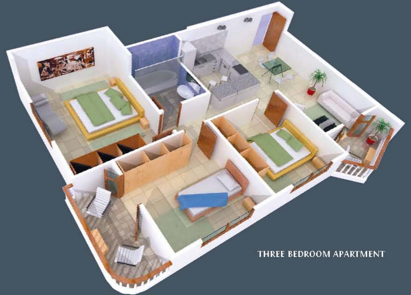
THREE BEDROOM APARTMENT