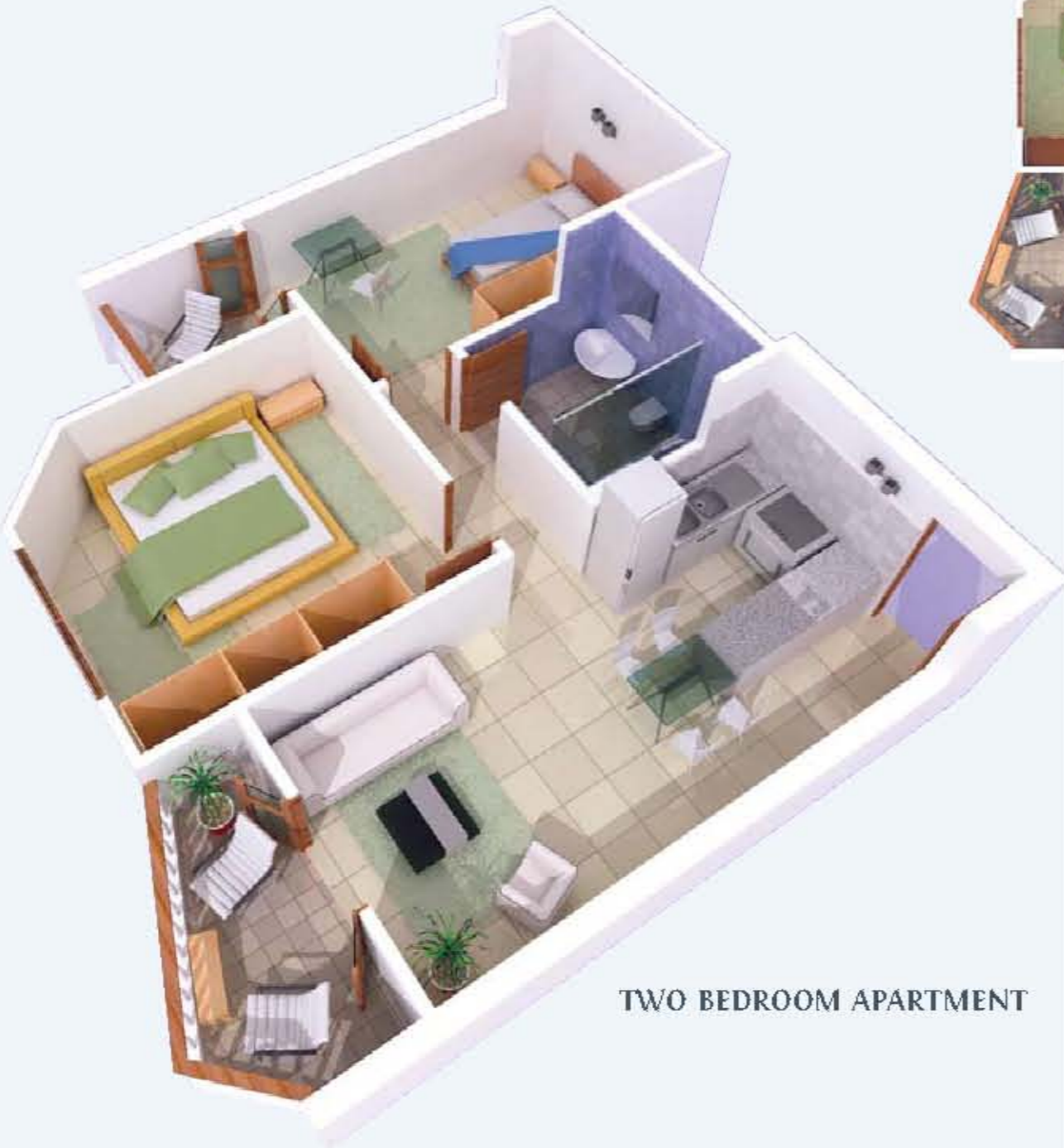
TWO BEDROOM APARTMENT